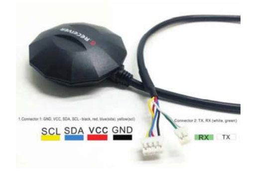
GPS pin diagram via the GP-808G datasheet.

The I<sup>2</sup>C lines are for factory programming of the module. No register data is available in the device's datasheet. All communication with the device in this guide occurs over serial.