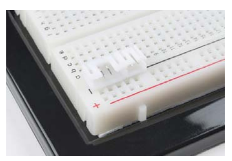
Connect the GPS male JST connectors into the female connectors. You can now wire the GPS Mouse to the microcontroller using jumper wires.

To connect the module to a breadboard, insert the 4-pin and 2-pin female JST connectors.