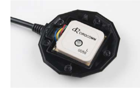
The pin out for the GPS connectors are as follows: